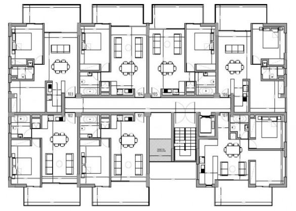
ΤΥΠΙΚΗ ΚΑΤΟΨΗ 1ου, 2ου, 3ου ΟΡΟΦΟΥ